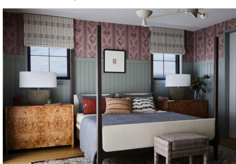
Primary bedroom

The year-long renovation process all happened during the height of the COVID-19 pandemic so there were many factors at play—design meetings over Zoom, supply chain issues, and a cross-country move for Doyle, Wambach, and their family. But, Lester says, working with the couple was easy: "They are kind, creative, and were so open to making their home unique to them. Every designer dreams of these kind of clients—I am lucky."