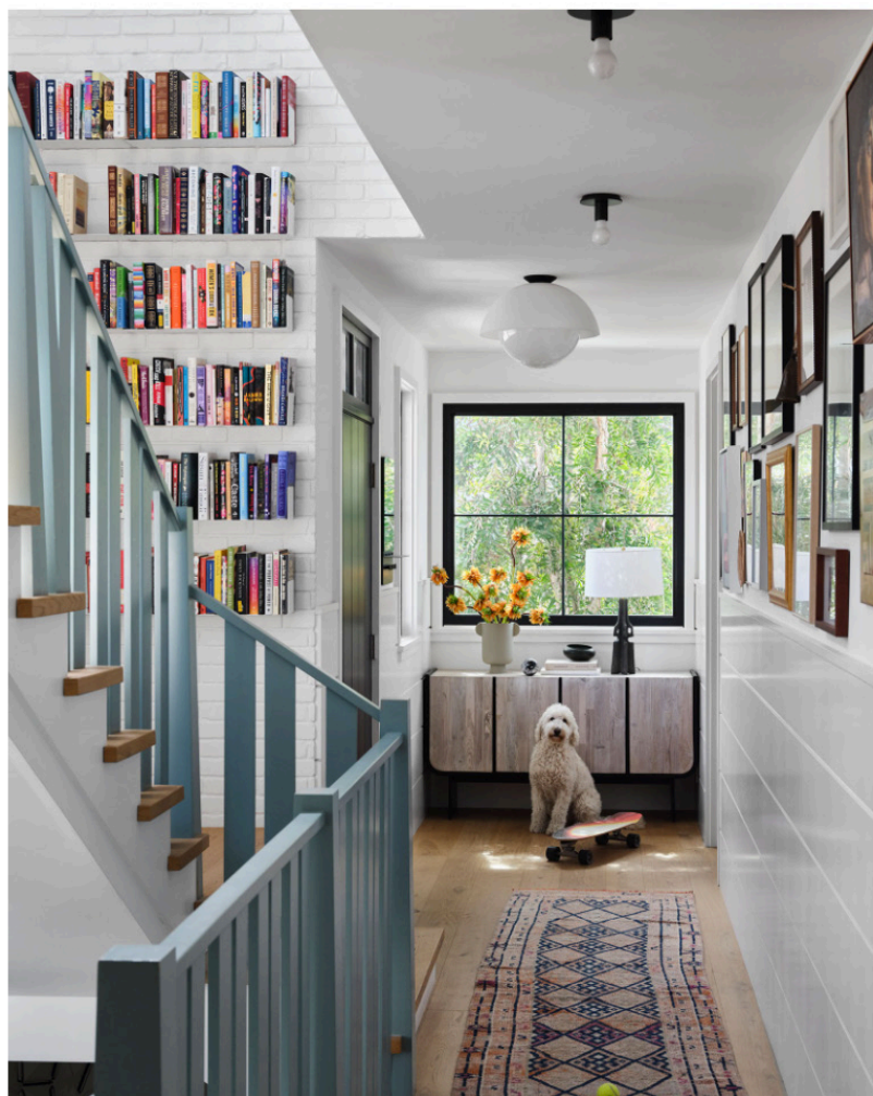
Entryway

The home's design also showcases talented California makers and vendors. "We also used so many female artists and craftspeople," Lester explains. "It was important to Abby and Glennon that their home was filled with things that made them feel happy and they were thrilled to support local female artists, craftspeople, and artisans. Each piece we selected tells a story and that's so important."