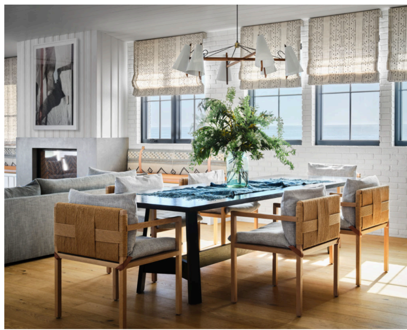
Dining area