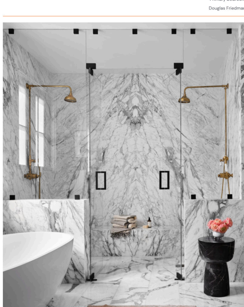
Primary bathroom