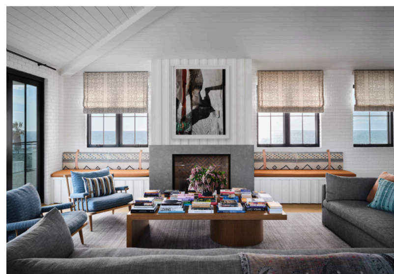
Living room